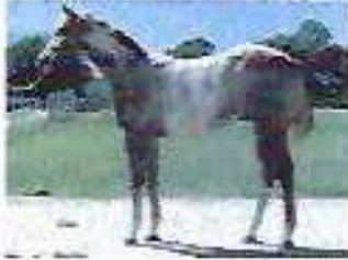
(click on horse photo to enlarge)